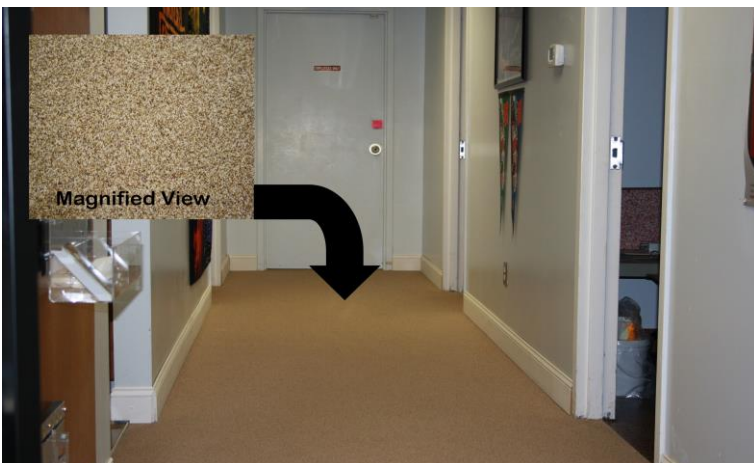
Colored Quartz Floor