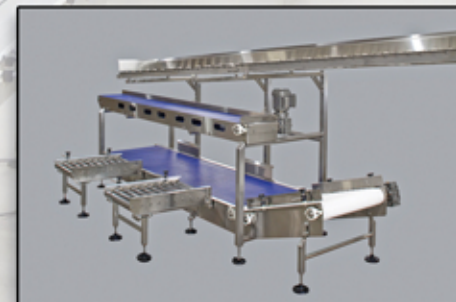
Multiple level pack-off station