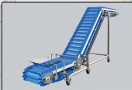
Portable food-grade incline conveyor