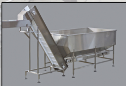
Hopper feeding into elevator