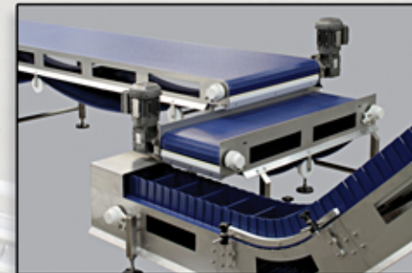
Shrimp processing conveyor

...be sure to visit advantageconveyor.com to see a full complement of galleries & videos of our projects.