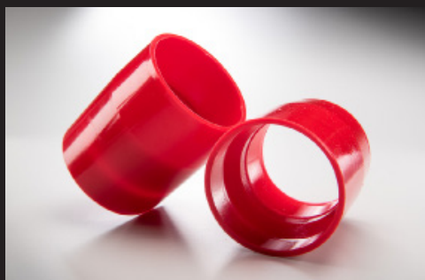
Retrofit Drain Seal