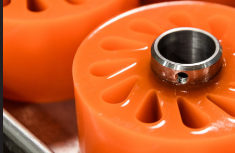
No Crush Wheels