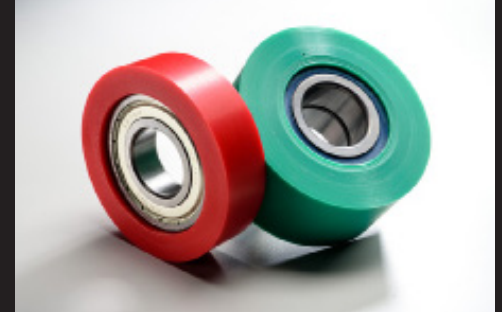
Urethane Covered Bearings